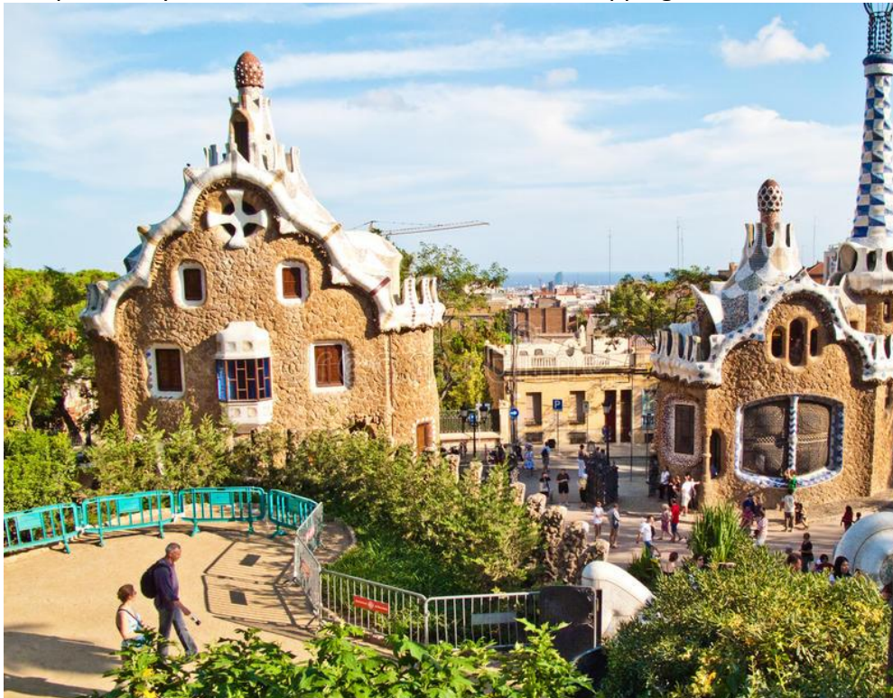
One of Gaudí's architectural master pieces

History continues to follow you as you visit the Impressive Papal Palace. Avignon was the home of the Popes for 70 years when religious wars raged in Italy. The city is located on the river Rhone which is one of the longest rivers in Europe. One of its bridges only spans half way over the river and there is a famous song singing about it. Perhaps you have heard of it!! We will arrange a concert venue in this lovely ancient town where you will also have time to enjoy the sites independently and do some last-minute French shopping. Dinner and overnight in Avignon.