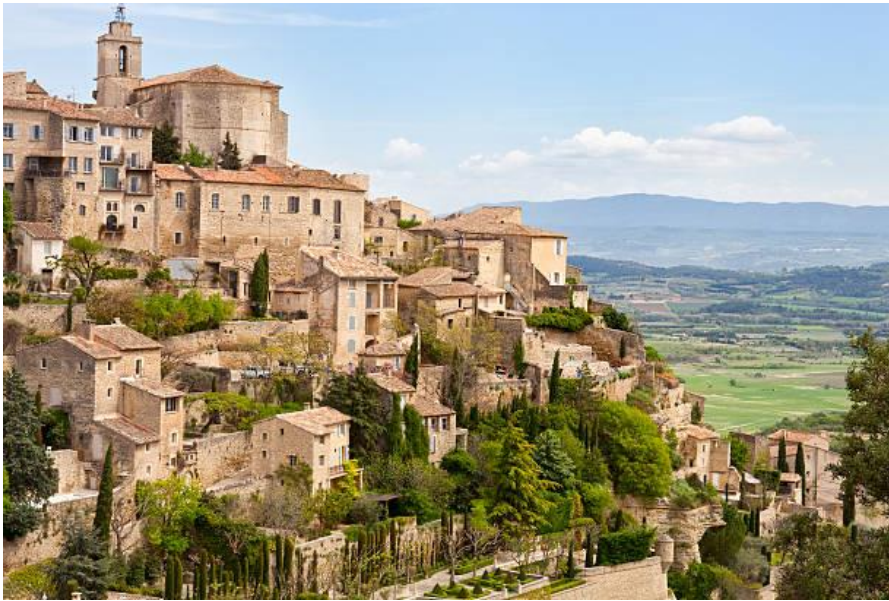
Village in central Provence