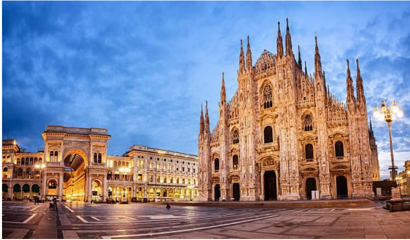
Duomo in Milan

Morning tour of Milan with a visit to the Duomo and hopefully to see the last Super fresco of Da Vinci. Time allowing and if possible, visit the Scala opera house before some time at leisure and concert venue. Dinner and overnight in Milan